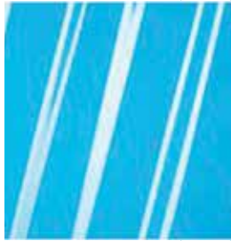
Transparent film with no visible water